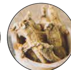
GINSENG 人參 Invigorates qi, boosts energy, strengthens the mind and nourishes the spleen and lungs. Meanwhile, the so-called pseudoginseng 三七 boosts blood supply and circulation, and eases pain.