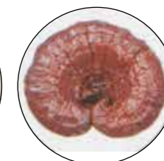
REISHI MUSHROOM 靈芝 Nourishes the heart, calms the spirit, enriches qi or vital energy, and pumps up blood supply.