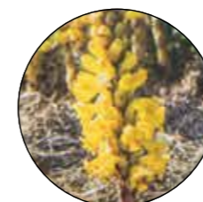
CISTANCHE 肉苁蓉 Tunes the kidney’s yang energy, enhances immunity, fights aging and boosts libido.

According to TCM experts, these are five of the most expensive sources of plant-based treatments and their claimed health benefits. Rare but readily available in Hong Kong, they are priced based on size or volume and whether they are farmed or harvested from the wild.