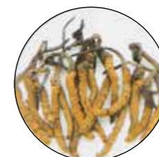
CORDYCEPS 冬蟲夏草 Enhances the immune system, boosts energy and eases fatigue.